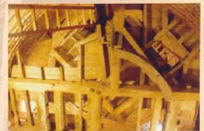
Vertical view of windmill beams.

The meeting room itself allows you to gaze all the way up to the top of the Windmill, with all its beams and architecture, dating back two centuries.